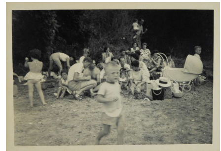
Members of the Kawerau Catholic Church enjoy a picnic at Ohiwa harbour while a young lad makes a dash for the water, 1960. Kawerau Museum, 2020.12