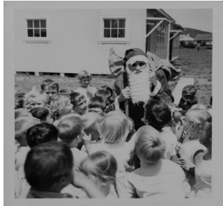
Christmas – Santa Claus makes a visit to Kawerau North School, Christmas 1953, kawerau Museum, 2021.182

We've had a quick look and found some old photos relating to Christmases past that we thought you might like to see. Perhaps you were one of the kids at Kawerau North School when Santa Clause made his stopover, or maybe one of your family members stood under that big tree full of lights?