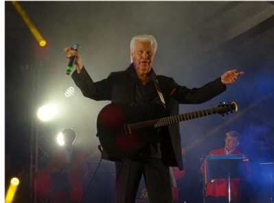
Sir John Rowles dazzles the crowd during his performance at Kawerau Christmas in the Park 2018.