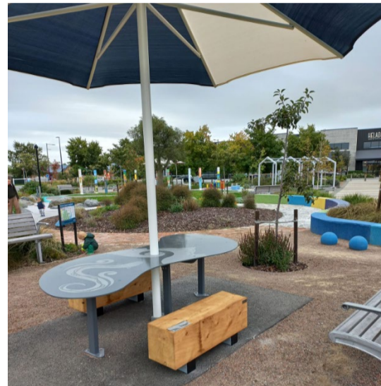
Selwyn District Council – Rolleston Town Library – Kai Table