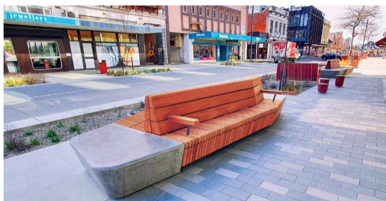
Invercargill City Council – City Streets Upgrades Stage 1 – Custom Benches