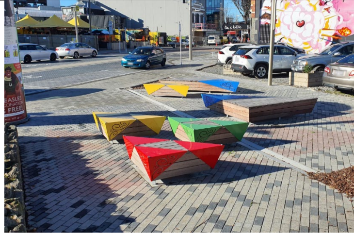
Christchurch City Council – High Street Upgrade – Custom platform benches