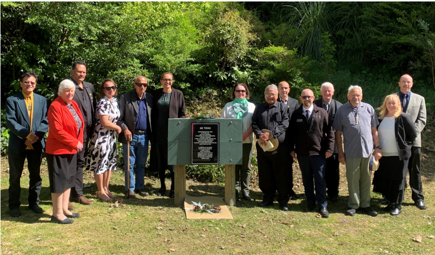
Mayor, Kaumātua, councillors and guests gather around the new Te Marukaa Plaque, after the unveiling.

On Wednesday, 25 September Council unveiled the new Te Marukaa Plaque. The plaque has been relocated near the Pumphouse Station on River Road; the move means it is in a more public area so the community can enjoy it.